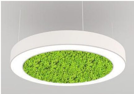
ROUND 2 (R2)